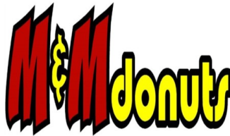
9081 FM 78 CONVERSE