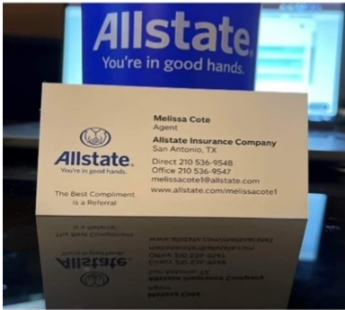
POST 593 MEMBER