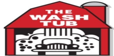
7535 FM 78