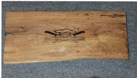
CUSTOM HANDMADE CUTTING BOARD BY HANNAH TAYLOR POST 593