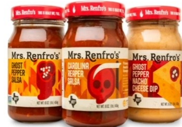
FORT WORTH, TX