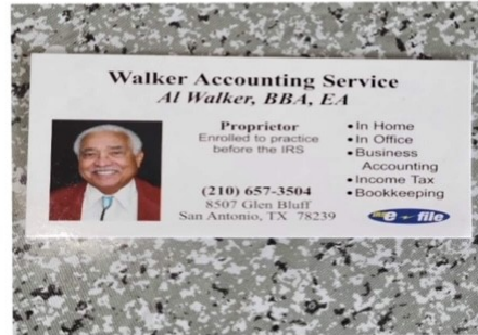
POST 593 MEMBER