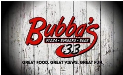
3136 PAT BOOKER, UC