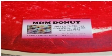
9081 FM 78, CONVERSE