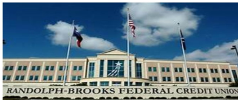
RANDOLPH BROOKS FEDERAL CREDIT UNION