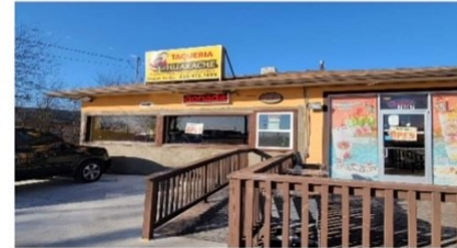
7 S SEGUIN, CONVERSE