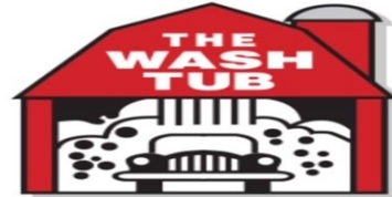
7535 FM 78