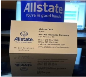
POST 593 MEMBER