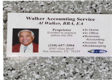
POST 593 MEMBER